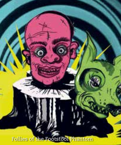
Follies of the Footstool Phantom