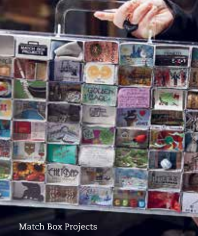
Match Box Projects