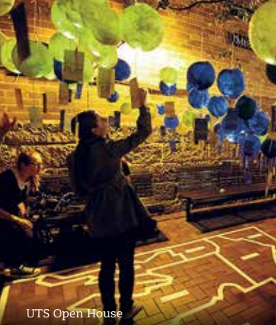
UTS Open House