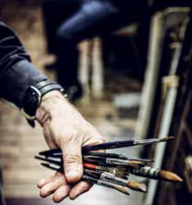
Julian Ashton Art School