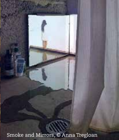
Smoke and Mirrors