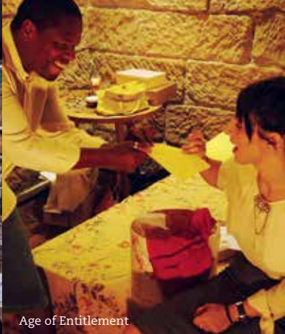
Age of Entitlement