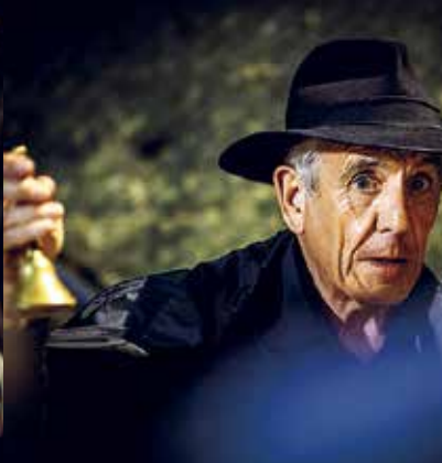
Paranormal Fright Nights