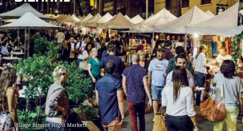
Village Bizarre Night Markets