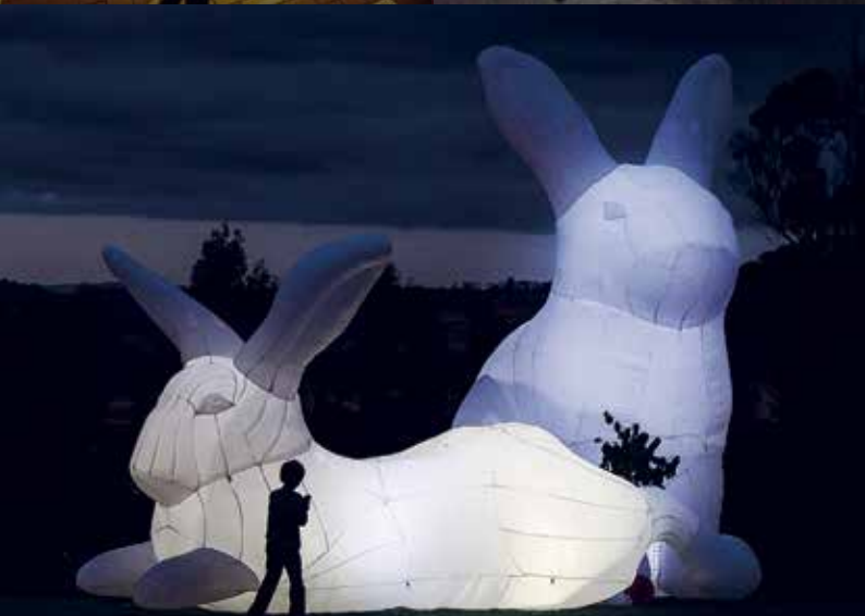
Intrude, © Ness Vanderburgh