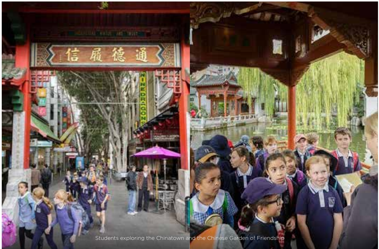
Students exploring the Chinatown and the Chinese Garden of Friendship