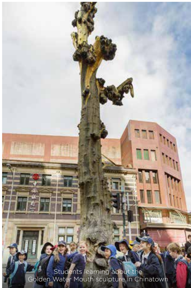
Students learning about the Golden Water Mouth sculpture in Chinatown

Before commencing the riddle activity, students will hear about the history and significance of the Chinese Garden of Friendship. Students will then take turns in interpreting a map of the Chinese Garden of Friendship and help the group navigate to the special places within the Garden where they will make a short stop with their guide in order to solve a riddle. While solving riddles, they will also discover how the Garden magnificently and symbolically embodies the values of Chinese culture. The riddle activity will finish when we find an ancient book that tells a legend of how the Chinese zodiac came to life. Students will discover their own sign in the Chinese horoscope and hear about personality traits that are represented by their sign. Your students will have an opportunity to make an origami rat, either in the Chinese Garden of Friendship or back in the classroom.