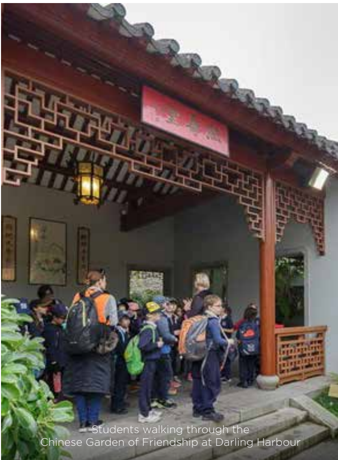
Students walking through the Chinese Garden of Friendship at Darling Harbour