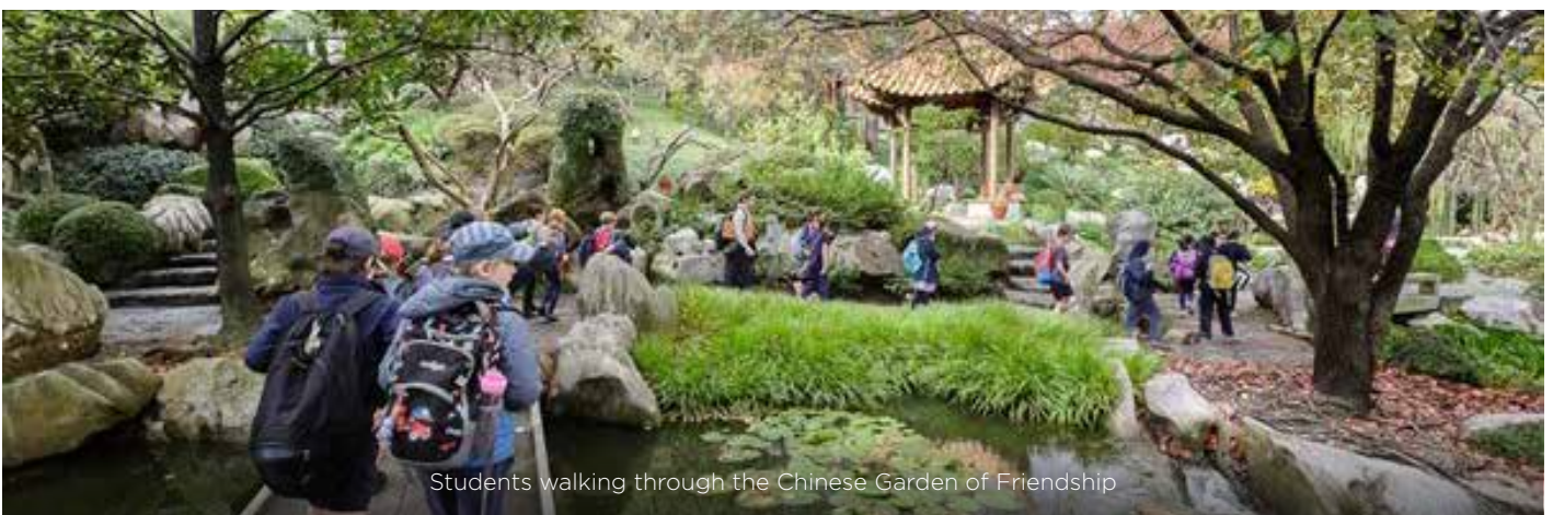
Students walking through the Chinese Garden of Friendship