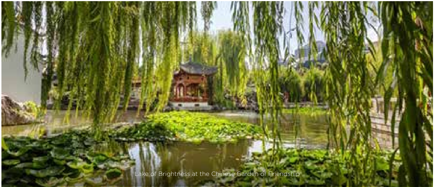
Lake of Brightness at the Chinese Garden of Friendship