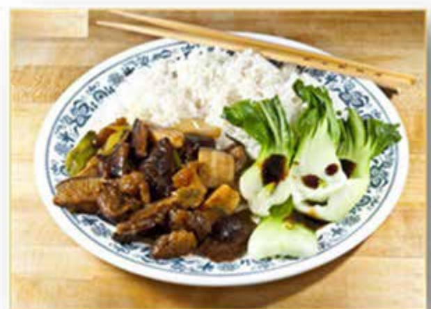
Braised sea cucumber and Chinese vegetables