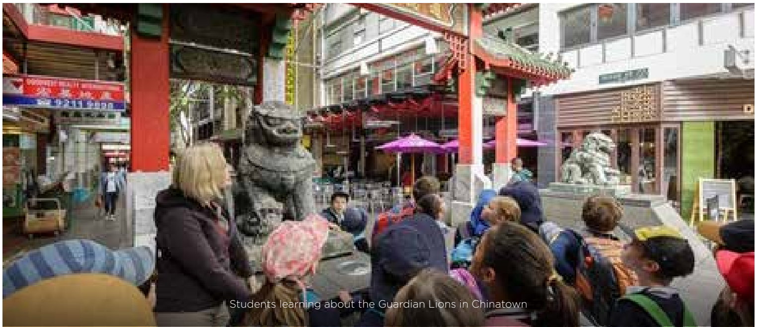
Students learning about the Guardian Lions in Chinatown