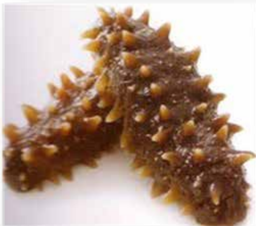
Sea cucumber (trepang)