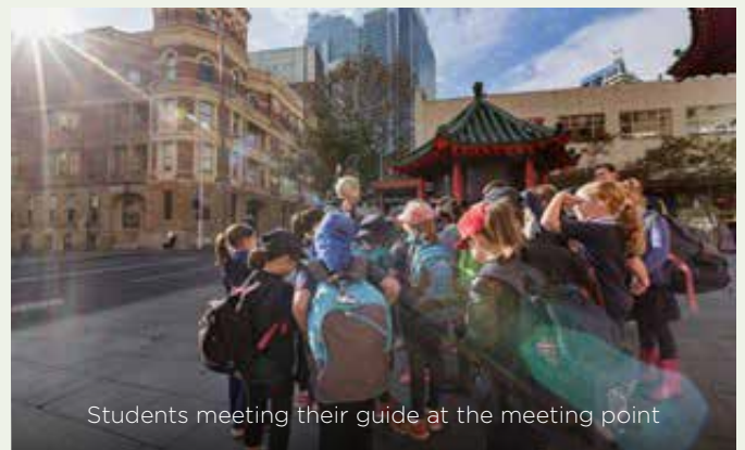
Students meeting their guide at the meeting point

Your Education Guide for the day will ask you to complete a short evaluation form before the completion of the program to help with our continuous improvement.