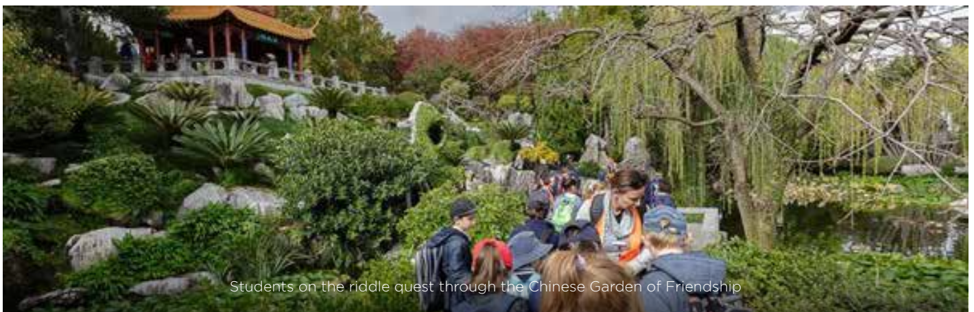
Students on the riddle quest through the Chinese Garden of Friendship